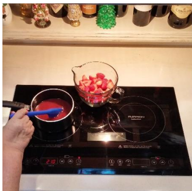
Thickening the Sauce