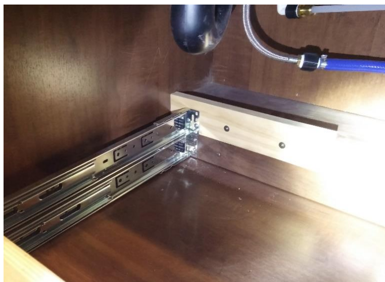
Cabinet Modification & Slide Installation