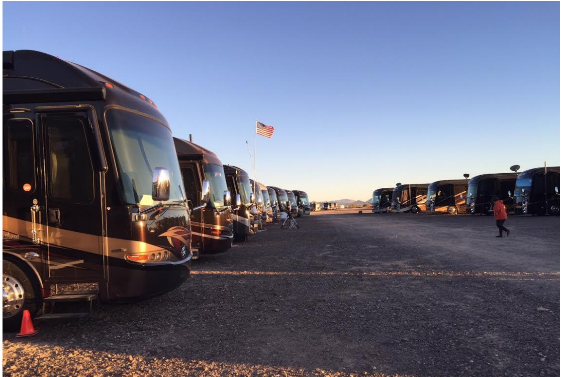
Two rows of Entegra coaches at Quartzsite

but also vendors hawking induction and regular cookware, steam mops for tile floors, and RV and insurance vendors. You also find Passport America, Good Sams, FMCA, and Escapees club. There are also reps from every big western RV park who are willing to give first time visitors free 3 or 4 day passes to their parks as a way to show off their offerings and attract repeat visitors. All in all, it is an OK show. What makes Quartzsite unique is that virtually every piece of bare land on the two main streets are leased by RV dealers who bring in hundreds of RVs of all shapes and sizes to hopefully sell during the show. There are dealers for used Prevost and Newell coaches, small trailers, used coaches and units for sale by owners everywhere there isn't a building. These dealers come in only for the show. A dealer from California, Paul Evert RV, brings in 15-20 new Entegra coaches for sale along with 20-30 other brands. Redlands Truck and RV is an RV repair operation that brings in 10 repair bays complete with lifts to lift 45-foot diesel pushers off the ground and do chassis and frame repairs. The RV show runs for 10 days and usually begins on a Saturday.