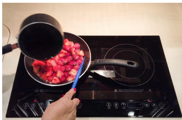
Adding Sauce to Berries