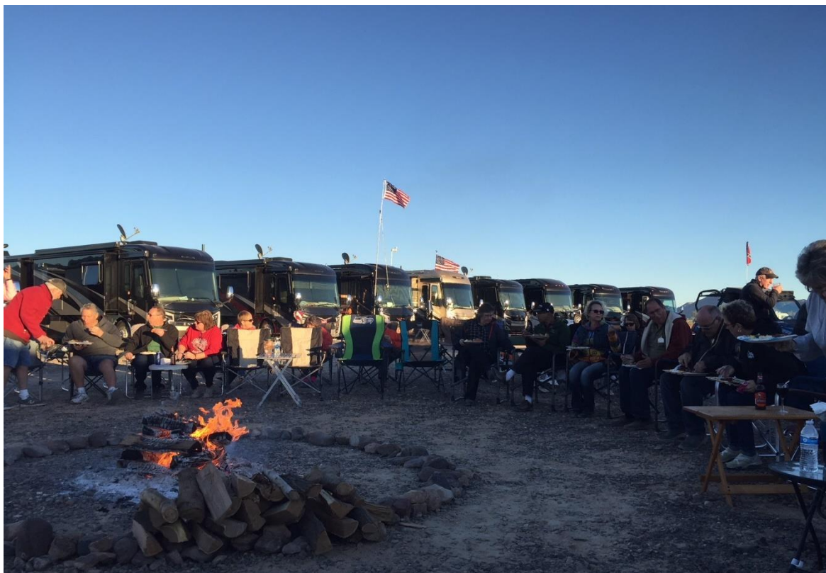
Evening gathering at Quartzsite

So, a total of 16 Entegra coach owners made the first Gathering. I insisted that it be called a Gathering to distinguish it from a Rally. At a rally, you usually expect catered meals, organized events, entertainment, and full hookups. At the QUARTZSITE GATHERING, you get promised none of that, you simply paid for wood and were told where we were going to gather. In some ways, a "high class Bohemian group" showed up in their