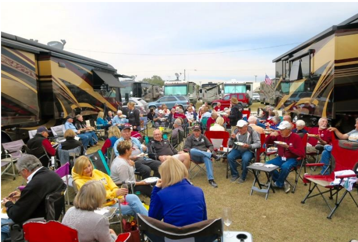
Tampa Supershow Pics Pat Bauer